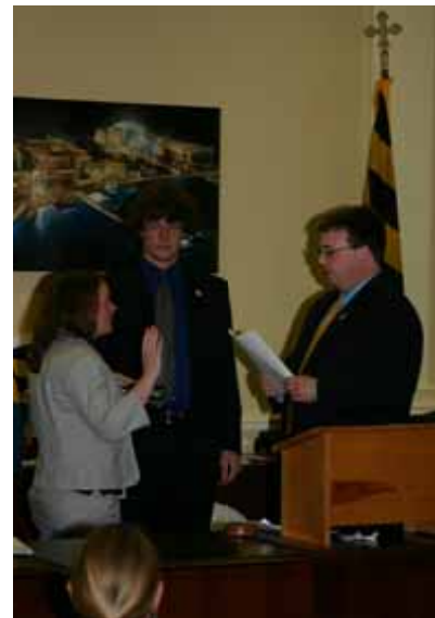
2008–2009 Governor, Amanda Arkwright, taking the oath of office