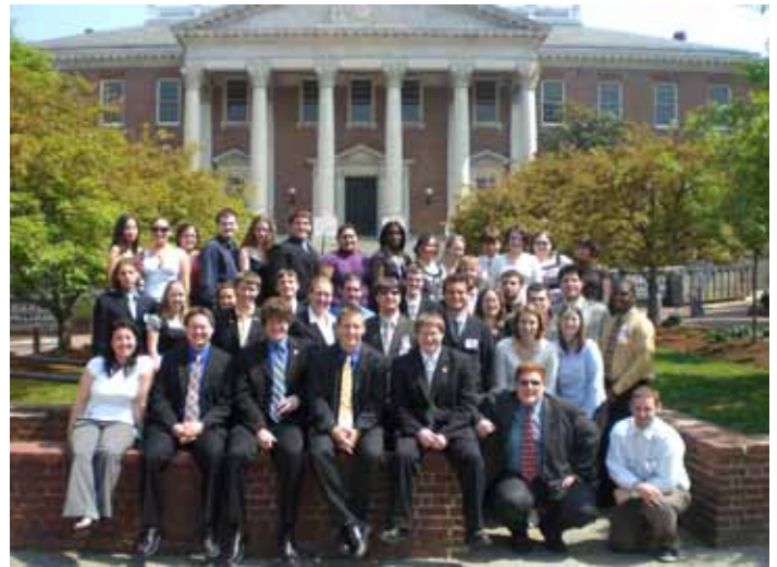
Students outside the State House