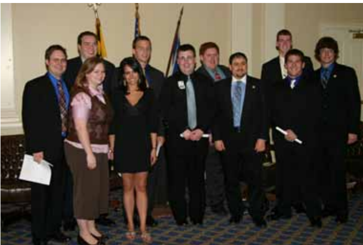
Alumni and student debate teams – Congratulations to the students for their first win. Maybe we can take back the title this year?