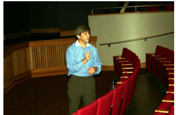
Senate hopeful Allan Lichtman speaks