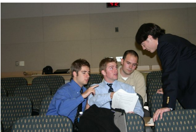
Students prepare for debate