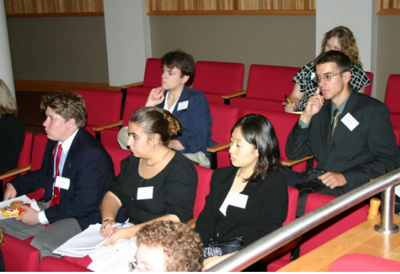
Students listen at an LTI session