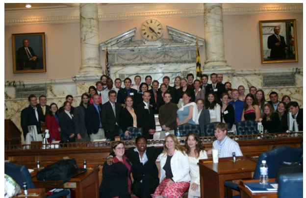
Over 80 students participated in the 2005 Annual Session

With business suits and ties, skirts and heels, and the familiar sound of a banging gavel all filling the chambers of the State House, the Maryland Student Legislature's 2005 Annual Session was underway. On April 29 th , students from universities across the state convened for the 16 th Annual Legislative Session in Annapolis. Twelve schools and over 80 members participated in a weekend full of intense debate on exceptional legislation. The Annual Session event marked the culmination of hard work and dedication afforded by all members throughout the year.