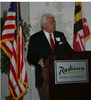
Thomas V. "Mike" Miller addresses the crowd at the "Tomorrow's Leaders Today" gala

One extraordinary highlight of the weekend was the 2 nd Annual "Tomorrow's Leaders Today" Fundraising Dinner/Gala. Student members, members of the Board of Directors and distinguished guests were graced with the presence of Maryland Senator Thomas V. "Mike" Miller, President of the Senate. Miller discussed the importance of the Maryland Student Legislature in